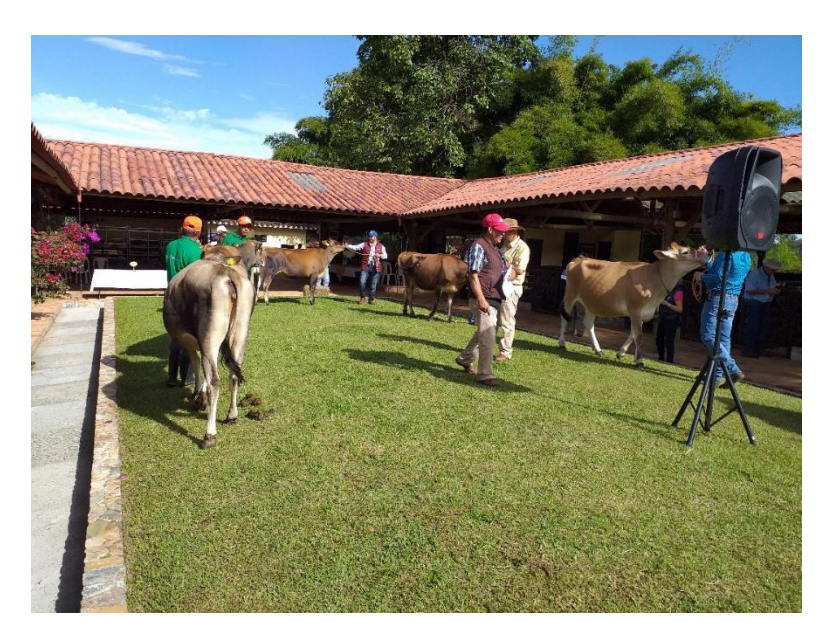
At the end of the visit we walked the grazing herd and paddocks.

It was a small show in an incredible place. After a wonderful lunch we had dessert and the best Colombian coffee.