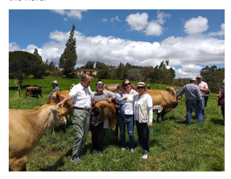
Builes Family showing the best cows

Before starting the tour to see the animals and the facilities, the records of production and the data of reproduction were presented by Lorena. Then the vet Wilmar Granados explained the selection program based on genomic tests in all the herd.