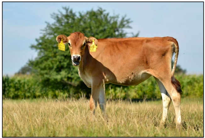
1. zemědělská a.s. Chorušice – has a big barn with 30 Jersey cows, 300 Holstein cows and 10 Brown Swiss cows. High management level and high milk production. The cows are very successful at shows. In 2017 they won at the National Jersey Show.