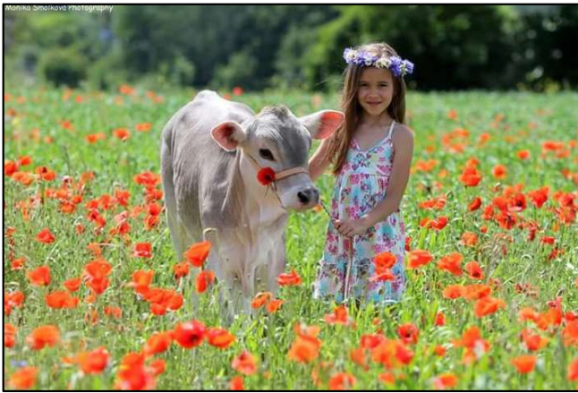
Farma Tehov - is a family farm with various species of farming animals, including 8 Jersey cows and heifers. They make their own Jersey milk products in the dairy directly on the farm. We will taste some of the products.