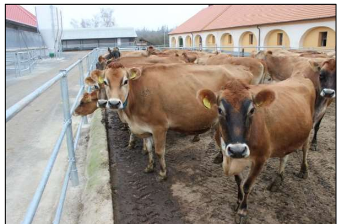
Školní zemědělský podnik Lány, farma Požáry – is a farm with 200 Jersey cows. Originally, they started with 80 Jersey cows in 1992. We will see a brand-new Jersey National Champion 2019 and Jersey National Reserve Champion 2019.