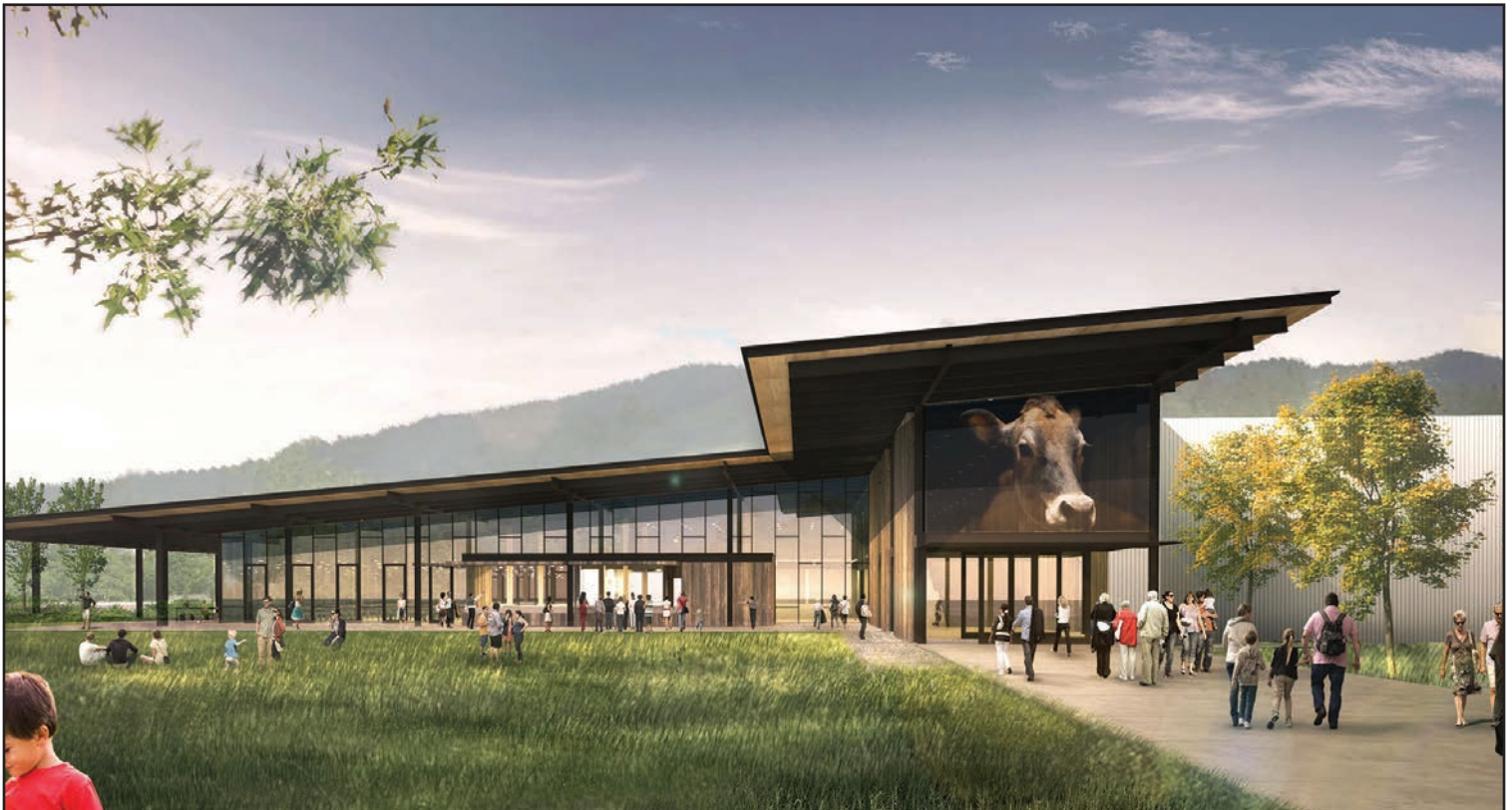
ARCHITECTURAL RENDERING OF THE VISITOR CENTER UNDER CONSTRUCTION AT TILLAMOOK CHEESE

NOT INCLUDED: Air Transportation from Portland to Columbus.