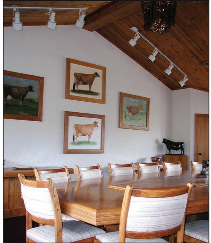
CONFERENCE ROOM AT AJCA-NAJ OFFICES

4:30 p.m. All assemble at the Wells Barn for social hour, dinner and program.